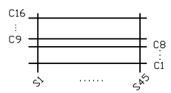
Panel Wiring Details Scale=free