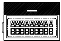
字体显示方向 SCALE 1:2